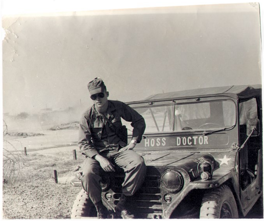
Taking a break on LZ (landing zone) Baldy, 196 th Light Infantry Brigade HQ, 1969.