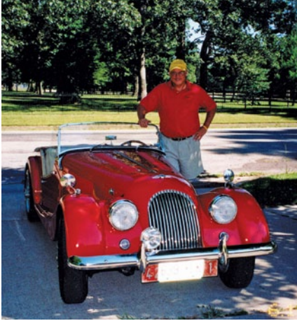
She's a beauty—the restored 1964 Morgan.

technical subject in your profession. And, the best part is we met some wonderful people during the adventure.”